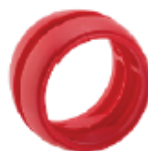
RQMR-MOVE Movable Insert