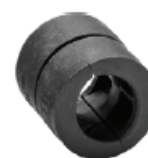
RQMR-Cabel Cable Clamp Insert