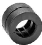
RQMR Reducer for Conduit