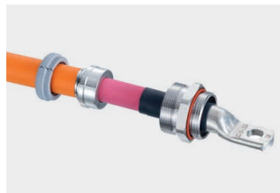
1. Push the cable lug through

Amazingly simple and robust: The "pluggable" (easily disconnectable) EMC shield contact solution makes the EVolution EMC extremely powerful. Due to the unique design of this shield contact solution, it is the first EMC cable gland that is designed to facilitate maintenance and repair (e.g. sealing ring replacement).