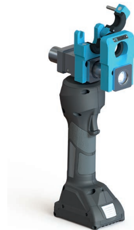
AXI-PRESS Crimping Tool