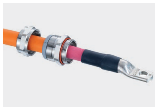
3. Slide over the sealing insert