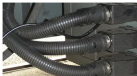
Low Maintenance Extended Service Life