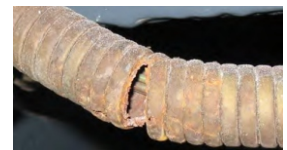
Metal Core Corrodes Limited Service Life