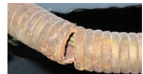
Metal Core Corrodes Limited Service Life