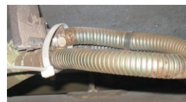
PVC Jacket Degrades Limited Service Life